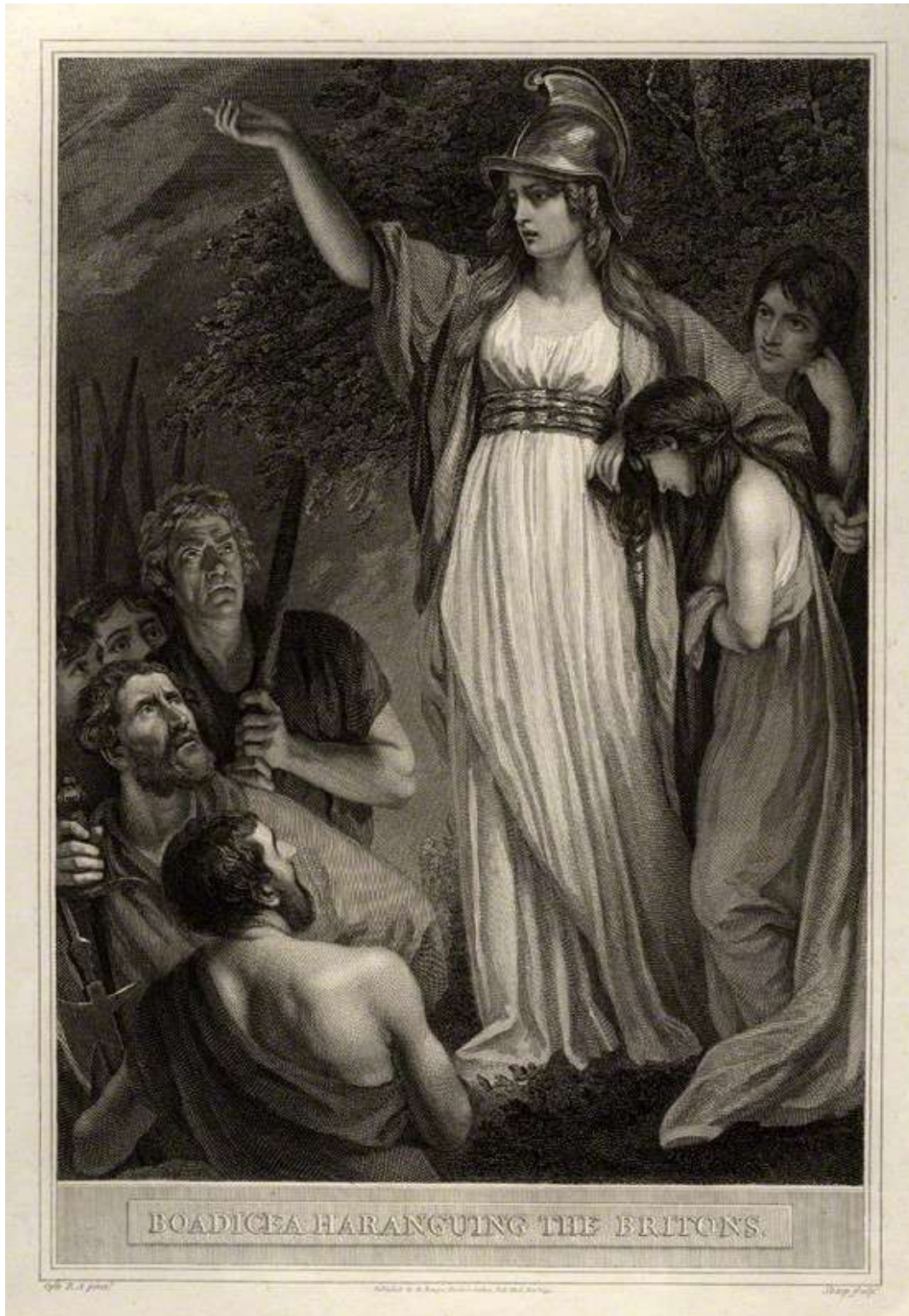
Boadicea Haranguing the Britons. William Sharp, after John Opie line engraving, portrait 1793 (358 mm x 253 mm) National Portrait Gallery, London