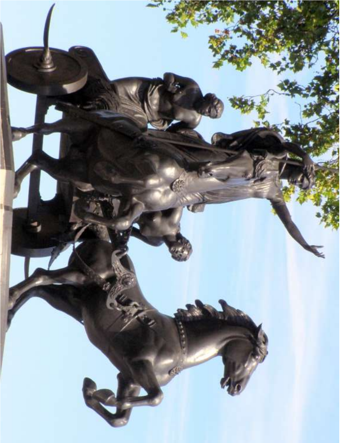
The bronze statue of Boudicca and her daughters, in a scythe-wheeled chariot, sculptured by Thomas Thornycroft between 1856 and 1885, and finally erected by the London county Council in 1902. The lines of William Cowper are inscribed upon the plinth: 'Regions Caesar never knew/ thy Posterity shall sway.'