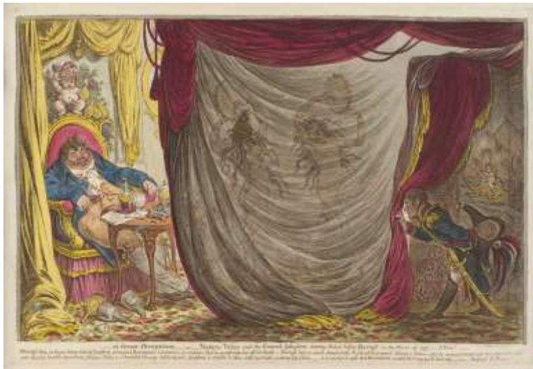
Fig. 4: James Gillray, 1805, Ci-devant occupations - or - Madame Talien and the Empress Josephine dancing naked before Barras in the Winter of 1797 - a fact! -, 1805, published by Hannah Humphrey hand-coloured etching and aquatint, paper size 31.4 cm x 46.5 cm. NPG D13042