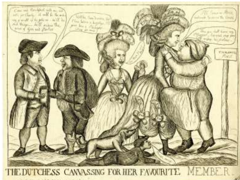
Fig. 3: William Dent, The Dutchess Canvassing for her Favourite MEMBER , 1784, Etching on paper, 22.5 cm x 29.5 cm (trimmed)

humiliation was deemed to be a legitimate “source of both humour and titillation for male viewers”. 35 The satire wrought against Devonshire employed perverse logic whereby fashionable accoutrements feminized her otherwise hypersexualized, yet oddly “masculine”, figure. 36 Perhaps the most scurrulous of the prints that degraded Devonshire is an engraving by William Dent in 1784 called The Dutchess Canvassing for Her Favourite MEMBER , in which her alleged sexual promiscuity is portrayed as bait to win votes. (Fig 3). We can observe how Devonshire’s hand gropes beneath the apron of a stout (apparently hapless) butcher as she proclaims: “I’ll leave no stone unturned to save the cause”. With scandalously raised skirts revealing her bare calves, the Duchess engages the butcher with her lewd gaze. His elevated apron is fetishistically transformed by Gillray intent on titillating the politically-minded male voyeur.