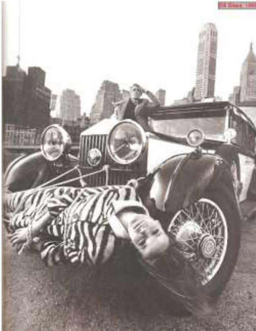
Fig. 1: Bill Blass fashion promotion, 1966, image accessed May 9, 2013, http://jezebel.com/5916650/fashions-ongoing-violence-against-women/gallery/1

Marketers link abuse and sexual violence to promote products and stimulate profits. These constitute vicious spectacles wherein women are viewed as unambiguously disciplined by men, and where men emerge as preordained conquerors. By employing this porno-chic motif, the implicit message is meant to inspire the desirability of glamorized violence, and the death of women. There have been other promotional thematics alluding to gang rape, such as that in a Dolce and Gabbana campaign in 2007. In an infamous display, a mob of semi-clad young men lay claim to a vulnerable, prone female being violently pinned to the ground by one of the “gang”. Although the ultimate message is that men and products claim ferocious victories over women, the main concern is of course the product itself: a suave suit, cool denims or strappy stilettos.